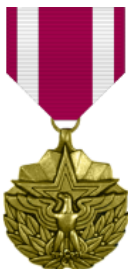
Meritorious Service Medal w/ 1 OLC