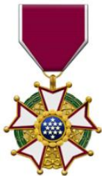
Legion of Merit