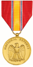
National Defense Service Medal