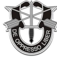
Special Forces Crest