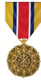
Army Reserve Components Achievement Medal w / 4 OLCs