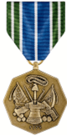
Army Achievement Medal w / 2 OLCs